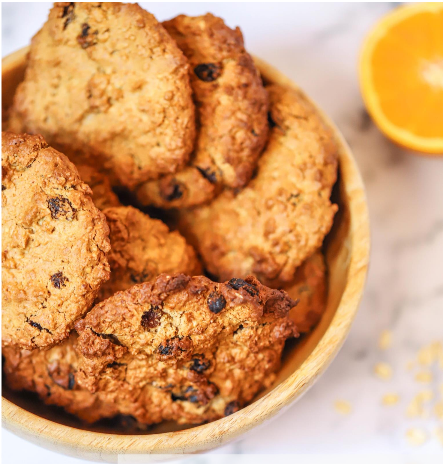
Raisin Oat Cookies