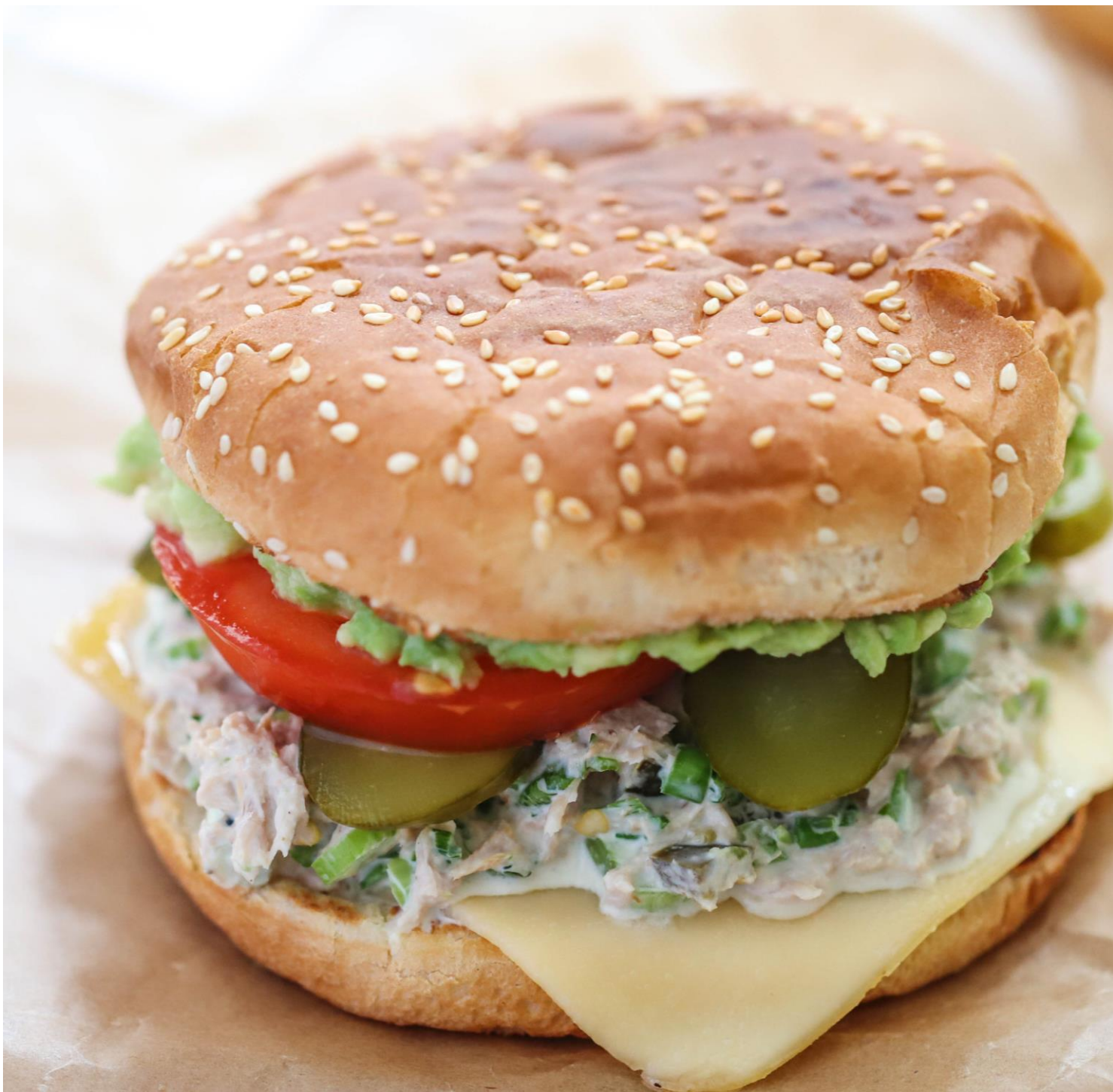
Spicy Tuna Sandwich